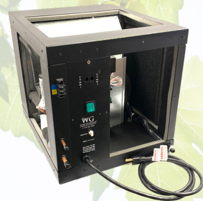
Removable cover panel for easy access