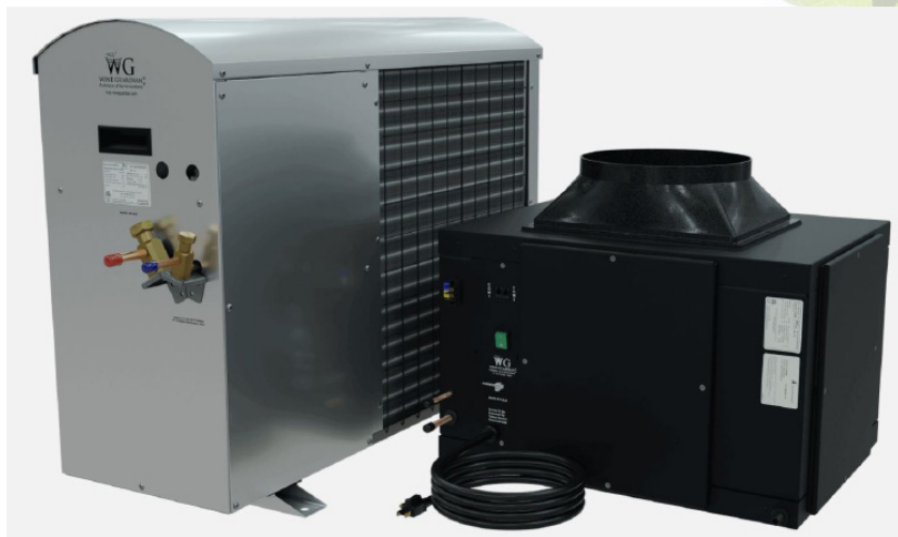
Wine Guardian condensing unit (L) and evaporator (R)