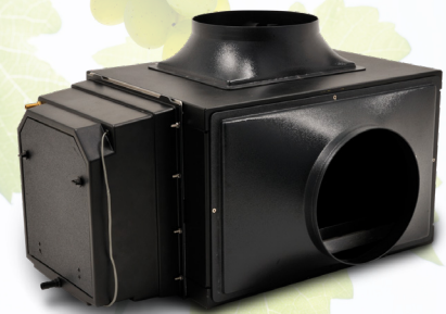
Ducted split system with optional, integrated humidifier